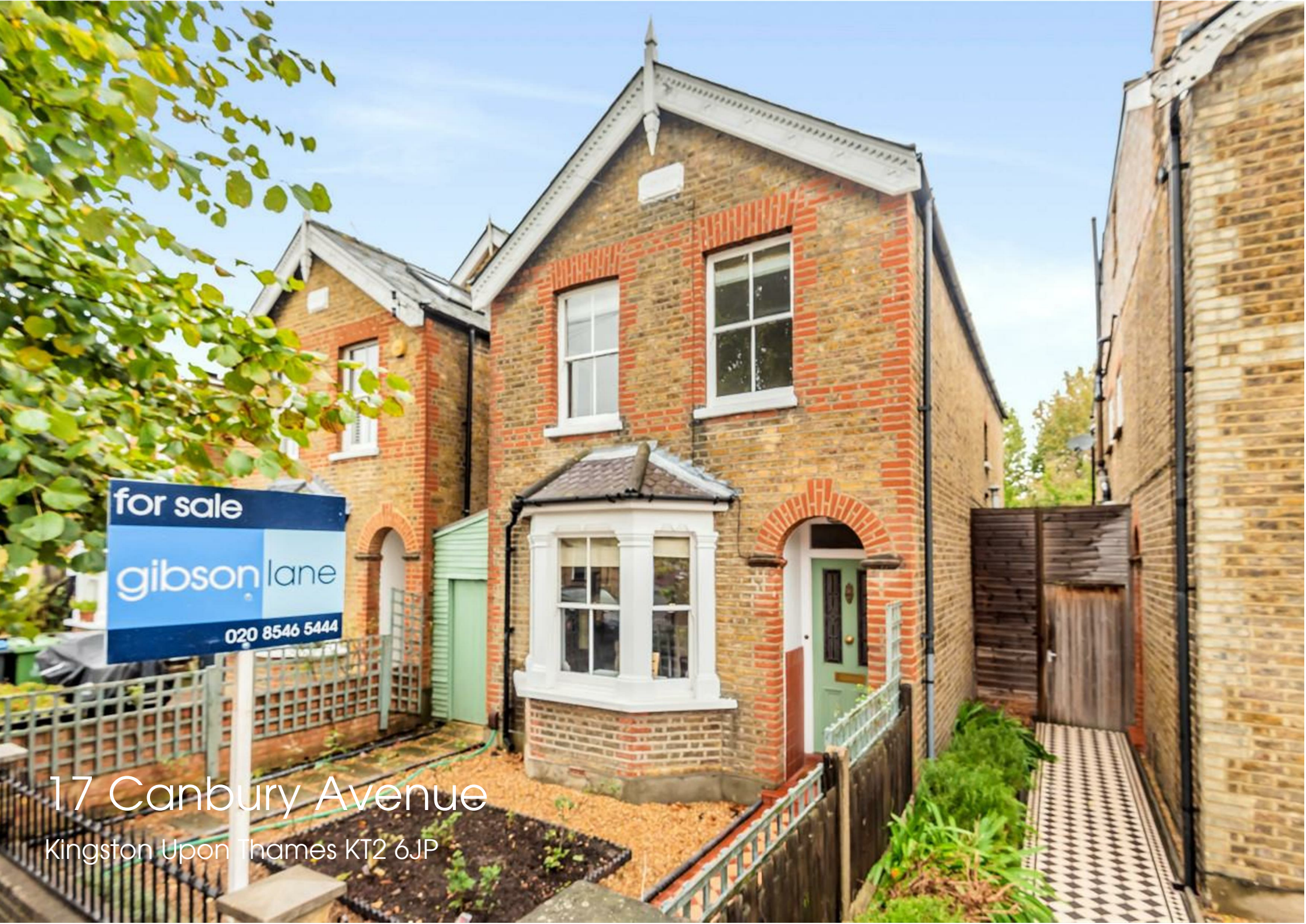
17 Canbury Avenue Kingston Upon Thames KT2 6JP

34 Richmond Road Kingston upon Thames Surrey KT2 5ED www.gibsonlane.co.uk Tel: 020 8546 5444